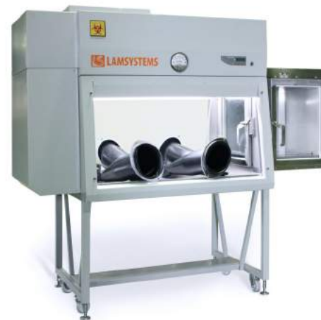
Class III Vis-a-Vis