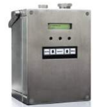
Formaldehyde and Ammonia Evaporator