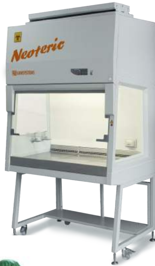
Class II Type A2