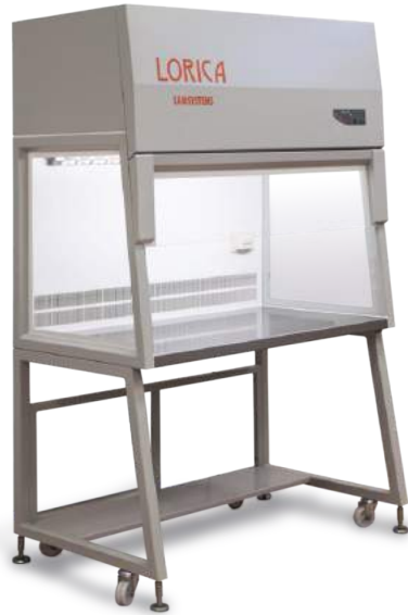
Vertical Laminar Flow Cabinets