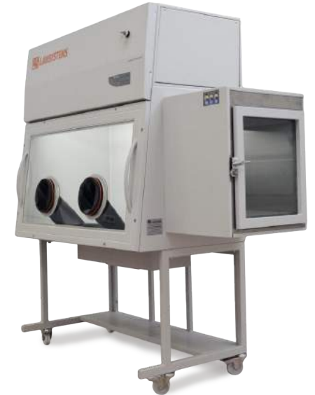
Glove Box Isolators