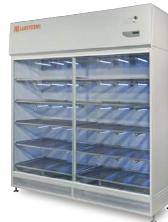
Sterile Storage Cabinets