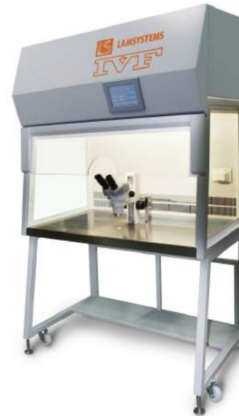
IVF Work Stations